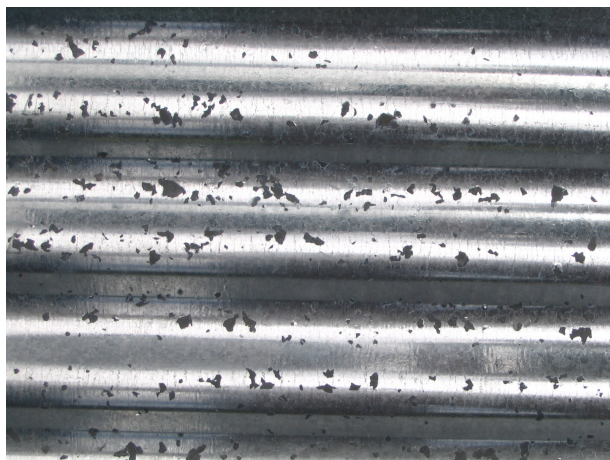
On corrugated sheet

phenomenon that is more commonly seen on metal surfaces in mechanical assemblies (e.g., bolted, riveted, keyed, or pinned joints, bearings) and electrical contacts, but can occur on galvanized sheet surfaces under certain conditions. While superficial, black fretting marks on galvanized sheet are almost impossible to remove, and are not the direct result of bulk water damage – which can also cause black (along with white) stains in its most severe form. When fretting occurs on galvanized sheet surfaces, liquid water is not necessary for its creation, although fretting can occur in the same areas of sheets that are additionally damaged by storage stain from entrapped moisture. For more information on fretting corrosion and how it is caused refer to GalvInfoNote 3.5 .