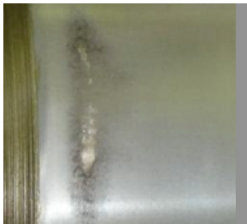
At the load-bearing point on coiled sheet